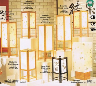
Shoji Lamp with floral pattern